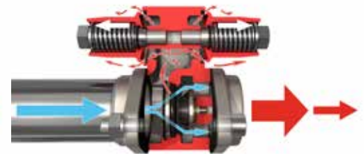
Regulated Flow Rate