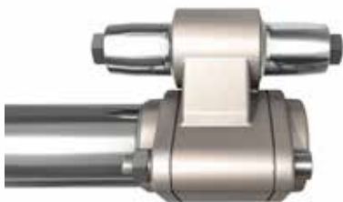
Flow Control Check and Relief Valve

A key component of this B200 model is the discharge optimized Check and Relief Valve. During unloading, when the pressure in the tank builds, this unique Relief Valve allows air to safely bypass the tank, gradually slowing product transfer.