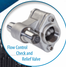
Flow Control Check and Relief Valve