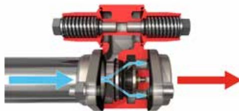
Full Flow Rate